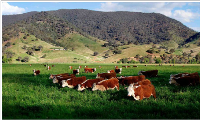
Hereford cattle raised as nature intended